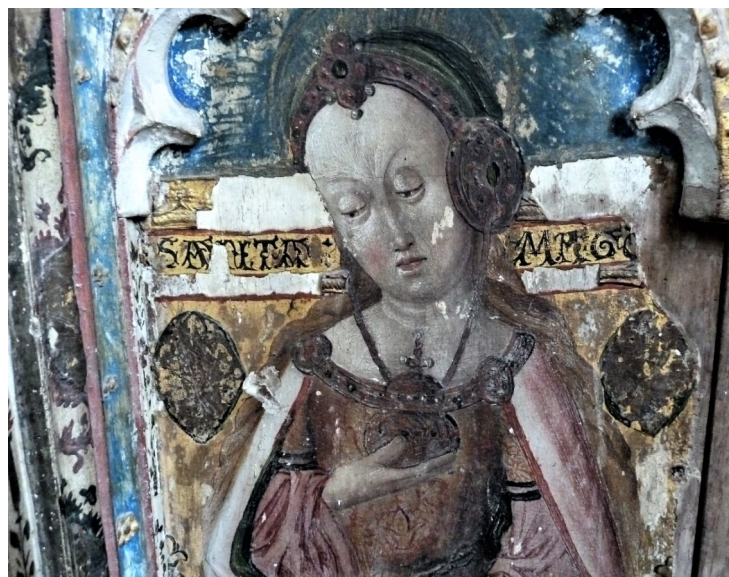
Bramfield St Andrews. Mary Magdalene panel