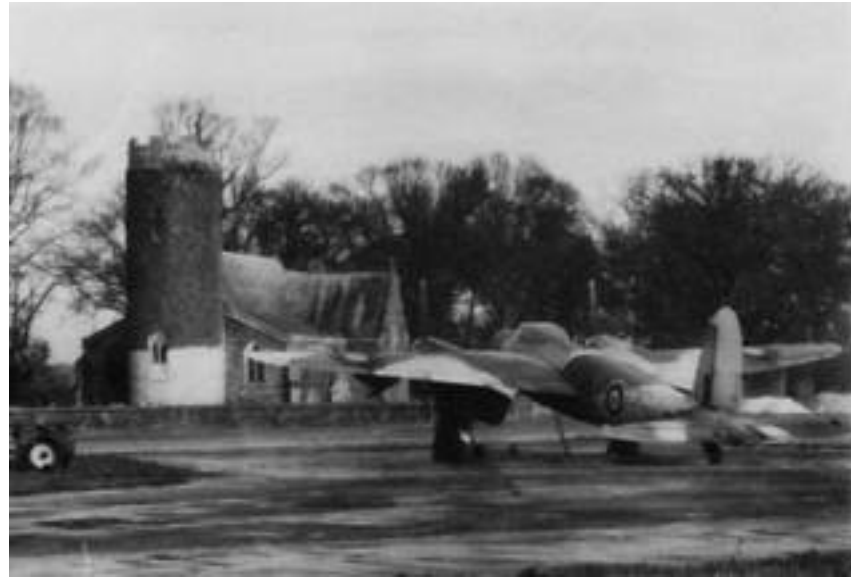
A Mosquito aircraft with St Peters church in the background.