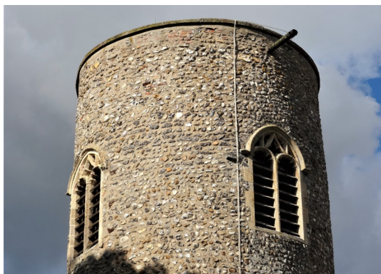
Letheringsett St Andrew