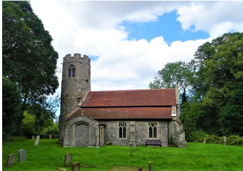
Matlaske St Peter

the church appears foreshortened. The chancel fell in 1726. Inside, the tower arch is faced with brick and there is a 15 th century font and cover. The Hanoverian Royal Arms are in good condition and there is a Commandments Board. An ancient chest and a wooden stretcher bier are stored on the ground floor of the tower.