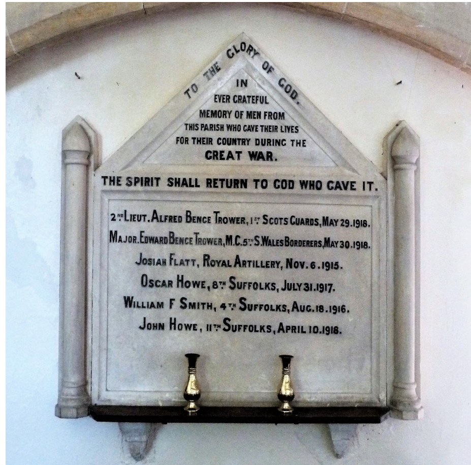
The Great War memorial at Thorington St Peter