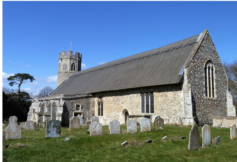
Theberton St Peter

met by some of the remains of Zeppelin L48, which crashed in the village in 1917. Also from the Great War is a memorial window to Col. Doughty-Wylie, who was awarded a posthumous VC for bravery at Gallipoli. North of the nave (inside the vestry) is a handsome Romanesque doorway with chevron moulding. A total length of almost 100 feet for the combined nave and chancel gives an impression of space to the interior and there is much more of interest, including an East Anglian style font, an aumbry in the north wall of the chancel and a late 15 th century pulpit.