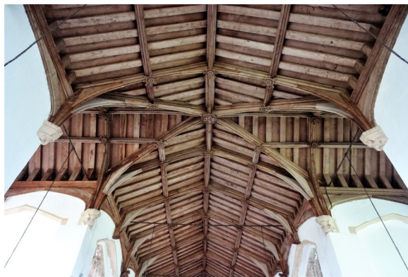
Stody St Mary