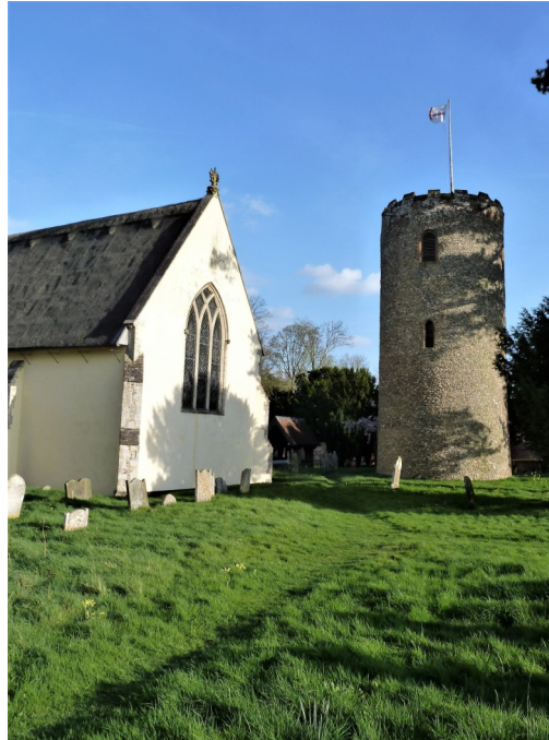
Bramfield St Andrew