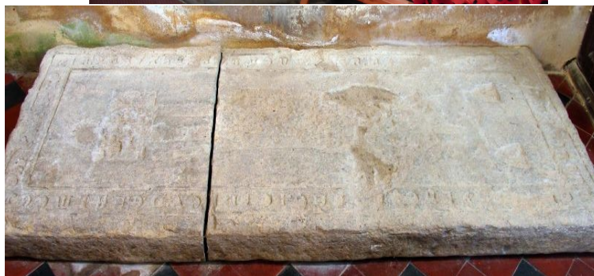
The inscribed slab.

The Norfolk Heritage Explorer (Haveringland Parish summary) reports the discovery of medieval pottery and post medieval pottery in the area around the church and a recent metal detector's discovery has been a medieval pilgrimage bottle with a scallop shell on one side and a shield with a coat of arms on the other.