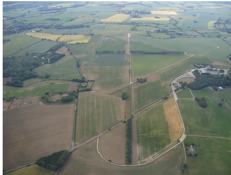
Aerial view of the site of the airfield today. St Peter's church is bottom right.