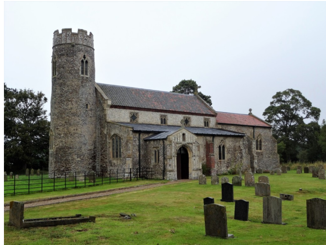
Wicknere St Andrew

Persistent rain had not dampened our spirits when we arrived at Thwaite All Saints . A tower circular for its full height of 45 feet, it was restored in 1896. Inside the church a fine pulpit is dated 1624 and the base of the 15 th century screen has some original colouring. Also of note, is a large ironbound chest and a floor brass that has survived complete with its inscription and the figures of John Puttok and his wife. During the 19 th century restoration a north extension was added. A notice hanging in this room mentions ‘Little Ones’ suggesting this may have been used as a Sunday School room.