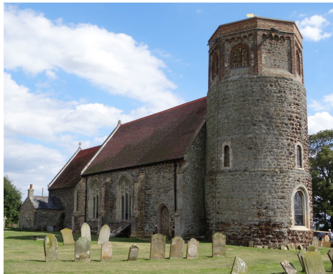
West Dereham, St Andrew.

West Dereham St Andrew has much conglomerate or ferricrete in its fabric. The tower has the largest diameter of the Norfolk Round Towers, measuring just over 17 feet internally at ground floor level. Including the octagonal belfry, it is 47 ½ feet high. The 16 th century octagon has bell openings framed in Tudor brick, with an arched frieze, also in brick, above. Inside the church a party of volunteers were working to install lavatory facilities, but this did not impede our explorations. A life size marble figure is part of the Memorial to Col. Edmund Soane, who died in 1706. He is shown in armour, with his helmet at his feet. ‘In the reign of King William and Queen Mary he went a volunteer to the wars in Ireland’. In the churchyard, another soldier is remembered. His gravestone tells us that Emmanuel Gaminara was born in Genoa in 1794. ‘He was a soldier in the 2 nd Imperial Guard under the ‘Great Napoleon’. He died at Downham Market in 1892.