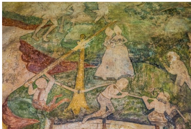
Part of the medieval mural