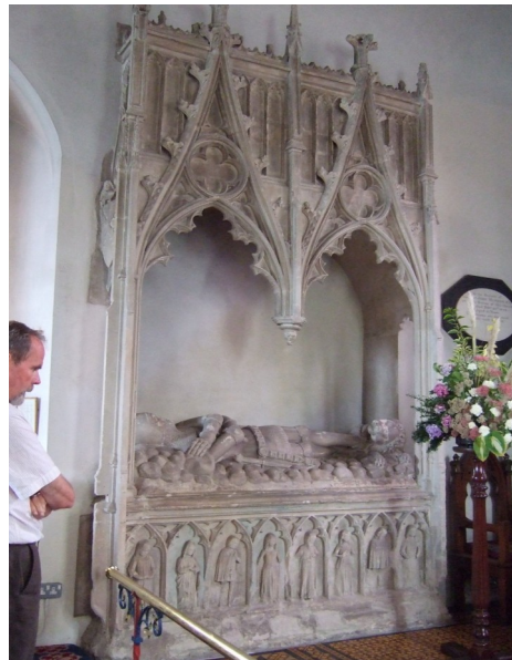
The de Kerdiston tomb. Unusually the effigy lies on a bed of cobbles.