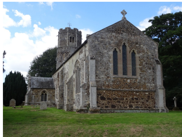
Bexwell, St Mary.

Bexwell St Mary was the first church on our August tour. The church is constructed predominantly of carstone. The tower rises to just over 50 feet and is circular for three quarters of its height, with a later octagonal top. Ten original belfry openings in the circular section are now blocked. Young swallows nesting in the porch welcomed us to the interior which was much changed during the 19 th century. On the south wall a 17 th century memorial has symbols of mortality, including an hour glass and a grave diggers spade. A 20 th century memorial records the death of 2 nd Lieutenant C.D. Prangley, the rector's son, killed during the Great War. His wooden battlefield grave marker is also on display. A fragment of medieval glass in a north window, shows the head of a man with a forked beard.