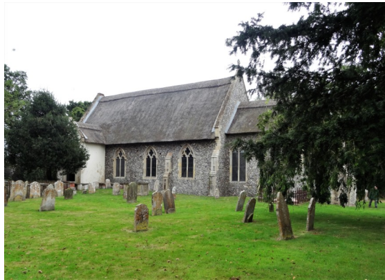
Thurgarton All Saints

A dull grey day heralded our September tour of three churches, which lie close to each other, south of Cromer. Unfortunately, the weather deteriorated as the day went on. Thurgarton All Saints is in the care of The Churches Conservation Trust. Long ruinous, the tower was taken down in the 19 th century. Its remains, as well as the nave and chancel, are thatched. Carved poppy heads and medieval benches are the great treasures of this church. 15 th century bench carvings include musicians, a dragon and two tuns (perhaps a partial rebus for Thurgarton). From more recent times, I particularly enjoyed the iron Tortoise Stove, with a tortoise displayed on the ironwork surrounded by the words ‘slow but sure combustion’.