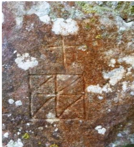
This is a close up photograph of the Hemblington merel mark.

It seems that the Christian meaning of the square was transferred to the merels board and, together with other elements, was used in folk art for Christian magic. Some merels can be explained this way, the meaning of others remains speculative. This mark is located by the north door, which could be significant to its interpretation as some form of ward.