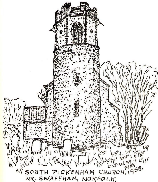
SOUTH PICKENHAM CHURCH, 1958. NR. SWAFFHAM, NORFOLK.

£2 to non members www.roundtowers.org.uk