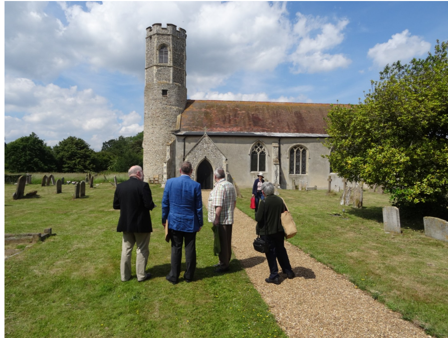
Woodton, All Saints