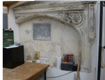
St Mary Coslany tower, roof, and memorials