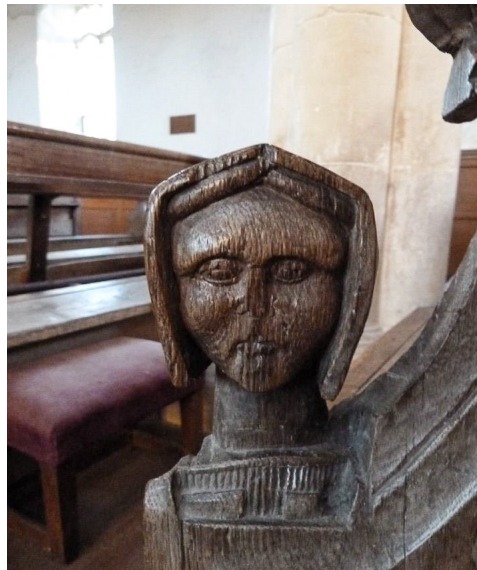
Bench end at Bedingham

Bedingham St Andrew ‘a rewarding and unspoilt church’ with clerestory windows over nave and chancel giving a well-lit interior. The 15th century screen has fine tracery, while the chancel has a dropped window sill sedilia with matching angled piscinae on either side. A 15th century font stands on two steps, the upper with quatrefoil decoration. Two ancient benches at the west end of the nave have carvings of human heads – male on one side and female on the other.