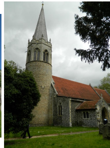
Quidenham St Andrew.