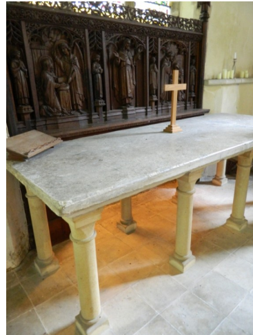
The Mensa slab at Eccles St Mary.