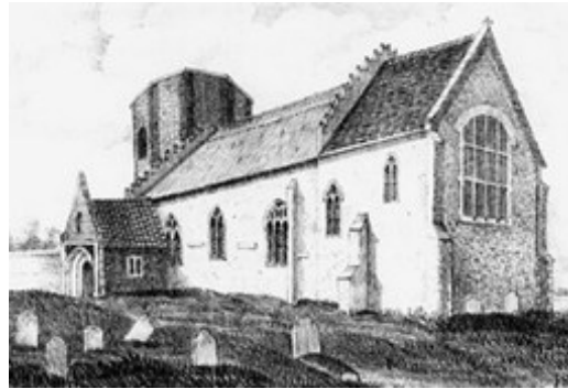
St Etheldreda tower and nave by Simon Knott, Skillet drawing before Victorian alterations and Plunkett photo of the interior