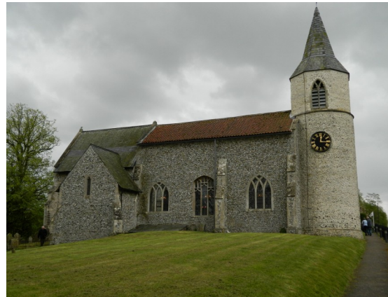
Croxton All Saints.