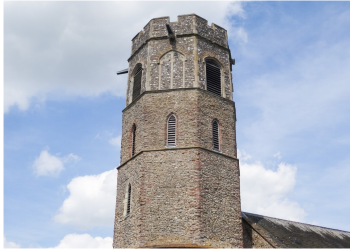
Topcroft, St Margaret.