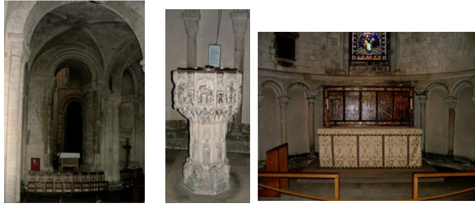
St Luke's chapel, font, and retable