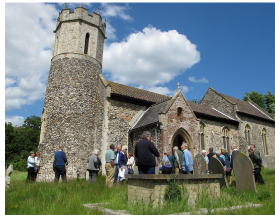
RTCS at Hassingham St Mary.