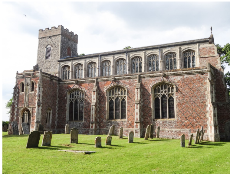
Shelton, St Mary