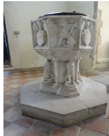
The font at Fritton, St Catherine.